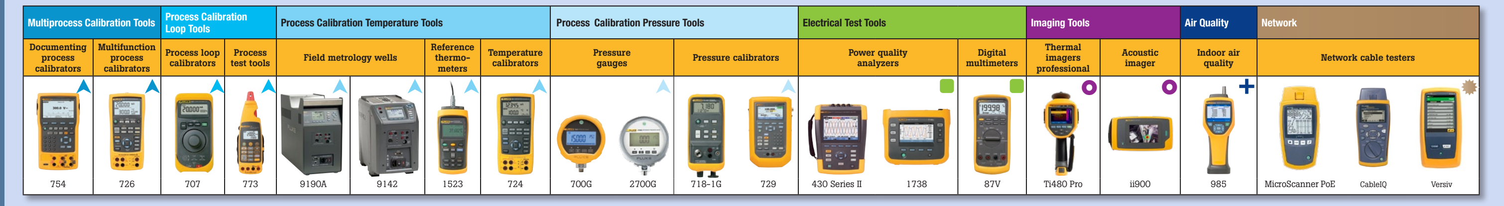
Diagram is not intended to be an exact representation. Diagram components are not to scale and are for illustration purposes only.

Learn how Fluke solutions can save you time and money while increasing productivity at www.fluke.com.